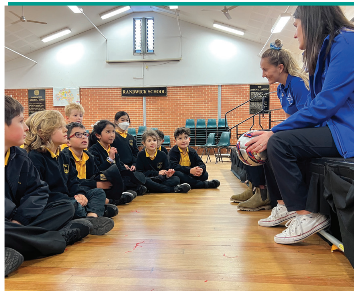
A Paralympic Education Program school visit delivered by Paralympics Australia

The Para-sport Equipment Fund program is an initiative between Paralympics Australia and Sport Australia which aims to address one of the most significant barriers to participation for people with a disability; the high costs associated with access to equipment required