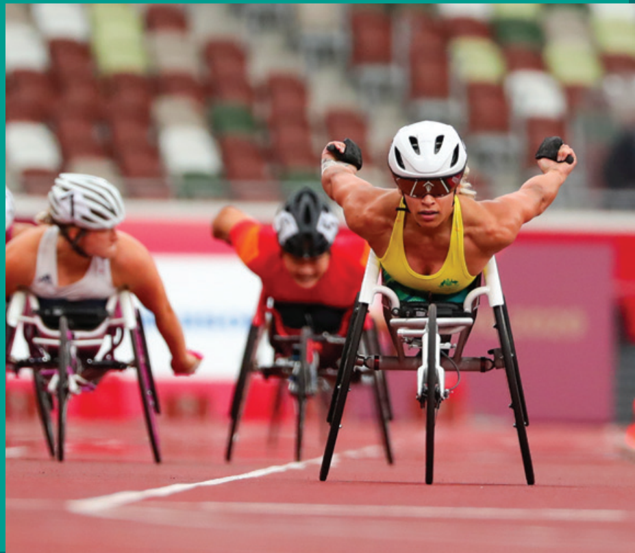
Madison de Rozario