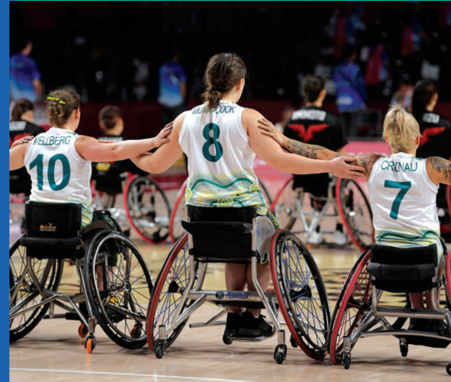
The Australian Gliders

The President role is an honorary position, as is the case for all PA Directors.