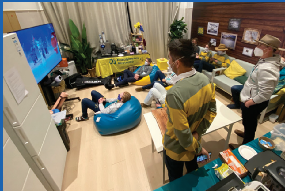
An Australian Team general area at Beijing 2022

Due to several data breaches in recent years, increased focus was placed on Information Technology security. Microsoft 365 and its suite of security protection and monitoring tools were used to mitigate risk and provide protection to Paralympics Australia Data.