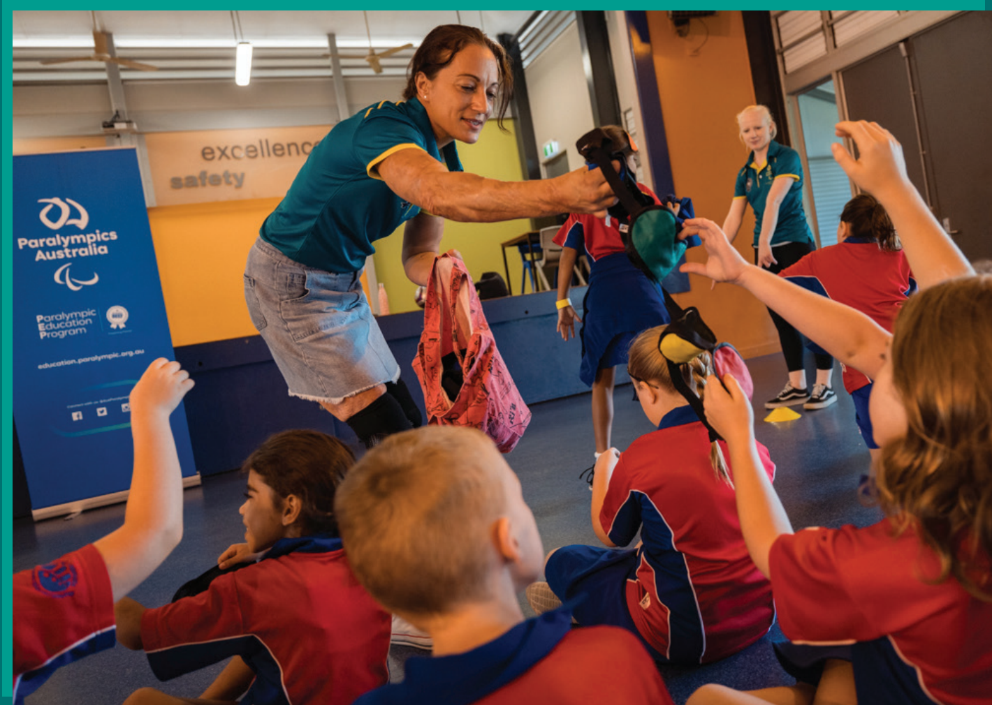
A Paralympic Education Program visit

to participate in Para-sport. While the program provides funding for a range of levels within the pathway, priority is placed on increasing access to participation in early stages of the pathway.