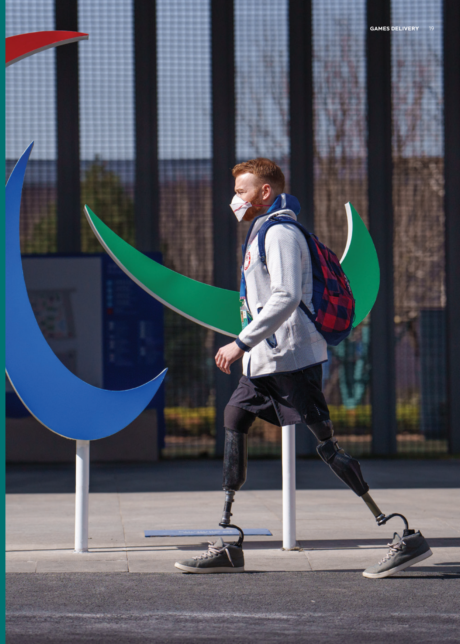
Paralympic Athletes' Village in Beijing