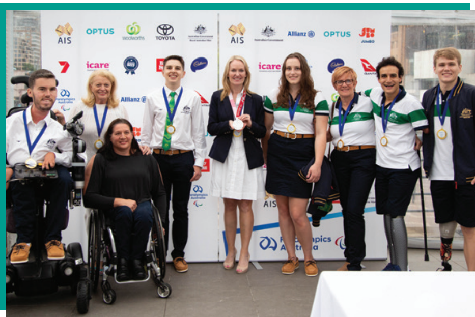
A Paralympics Australia sponsor event