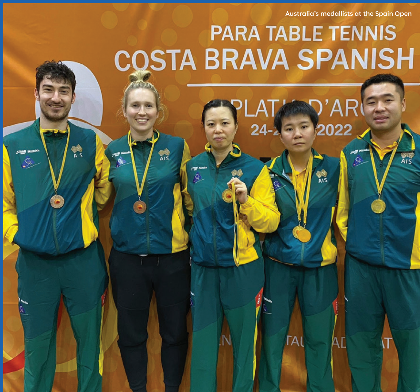
Australia's medallists at the Spain Open