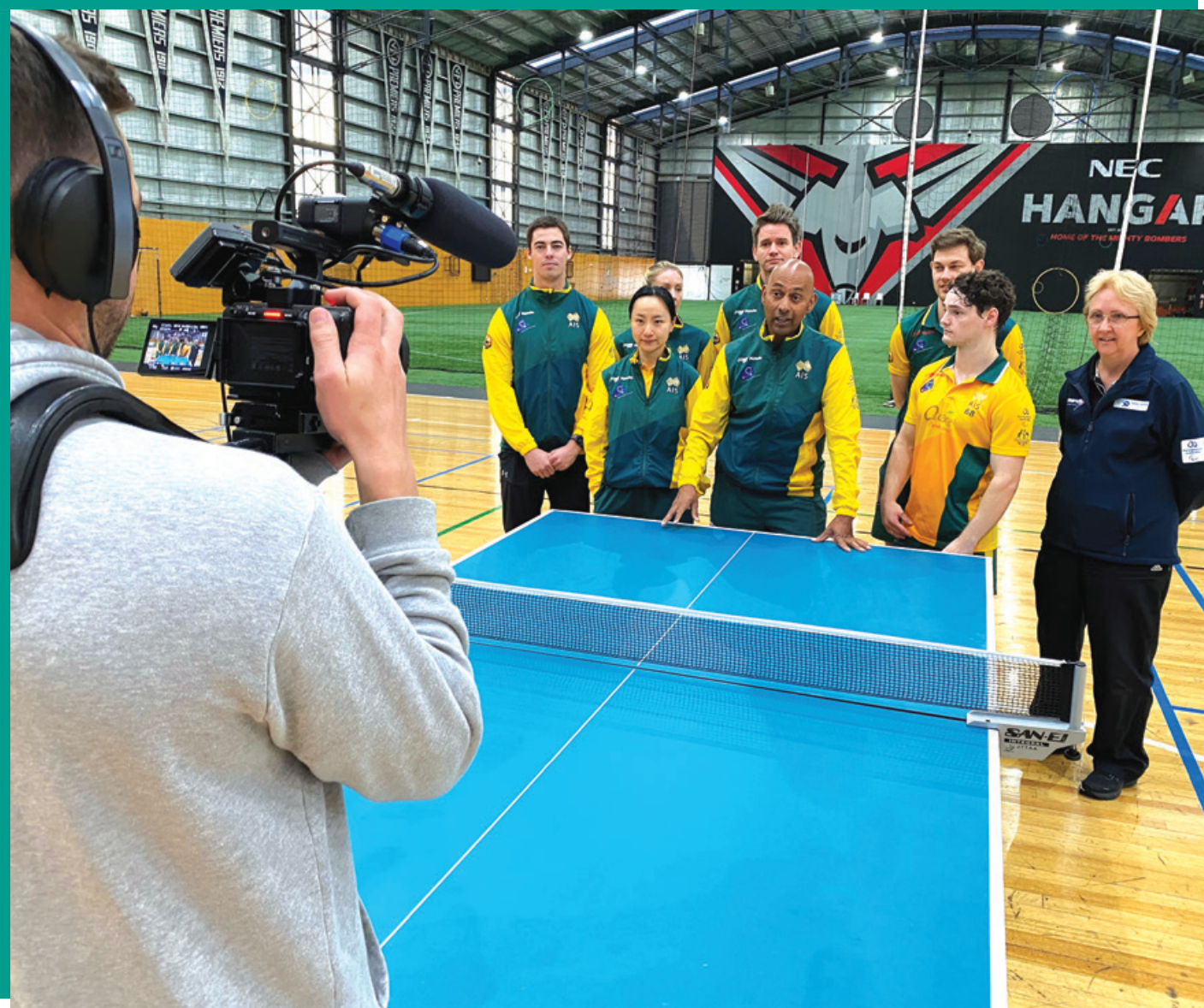
Capturing content with members of the Australian Para-table tennis team