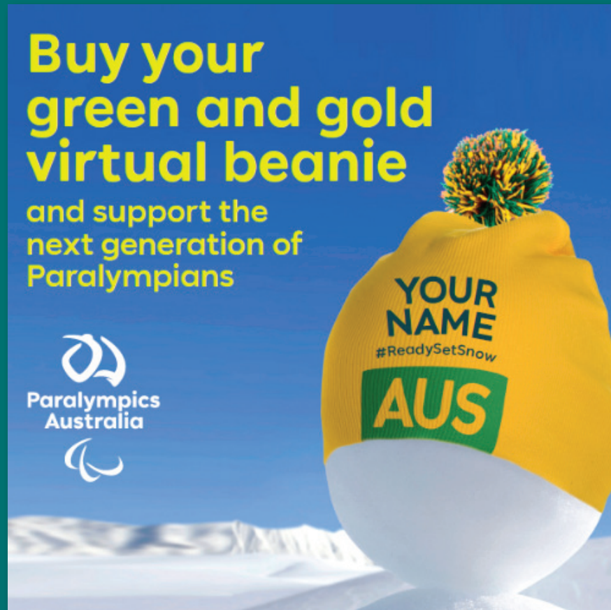
Virtual Beanies campaign