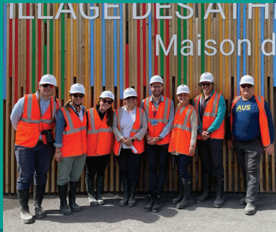
The Paralympics Australia delegation visits the Paris 2024 Paralympic Village

team uniforms for the next summer Games, in Paris.