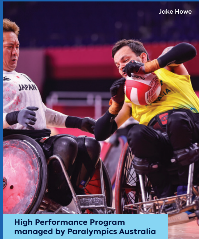
High Performance Program managed by Paralympics Australia

During the reporting period, the Australian Institute of Sport invested $19,657,800 in funding to 14 National Sporting Organisations and Paralympics Australia for high performance programs, athlete wellbeing and engagement and other special initiatives.