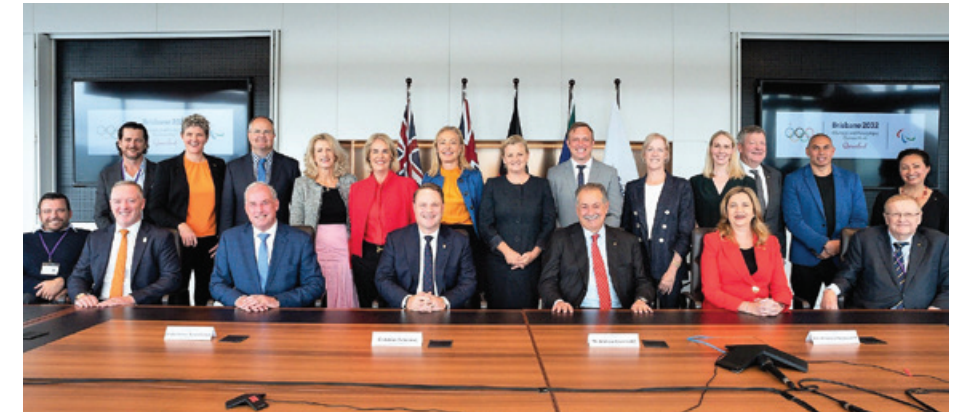
The inaugural meeting of the Brisbane 2032 OCOG Board