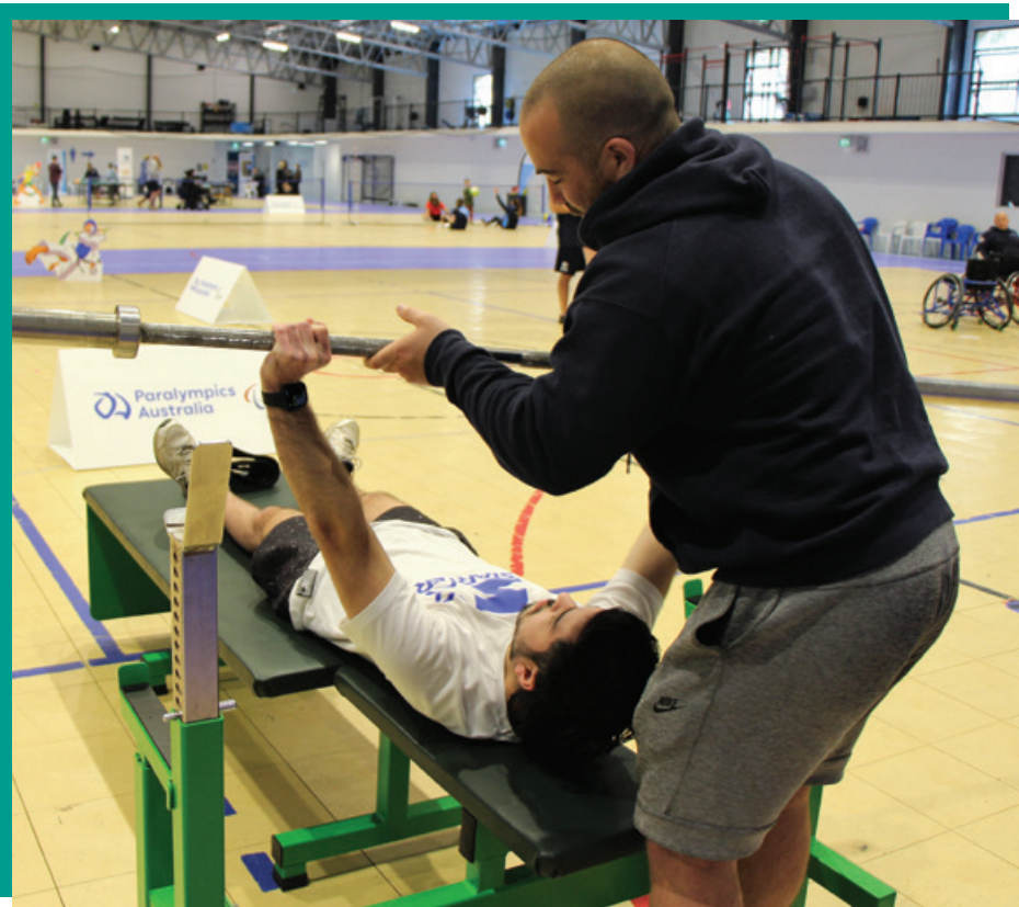
A Paralympics Australia Come and Try Day

in Paralympic sport. In December 2021 Paralympics Australia invested in a Coach Development role which was subsequently funded by part of the AIS Pathways Solutions Grant Investment of $402,000 over two years, with the purpose to explore and collaborate with system partners to increase impact and development opportunities for coaches in Paralympic Sport. The coach development team worked closely with the Para-sport Pathways, Innovation and High Performance teams to ensure maximum collaborative impact.