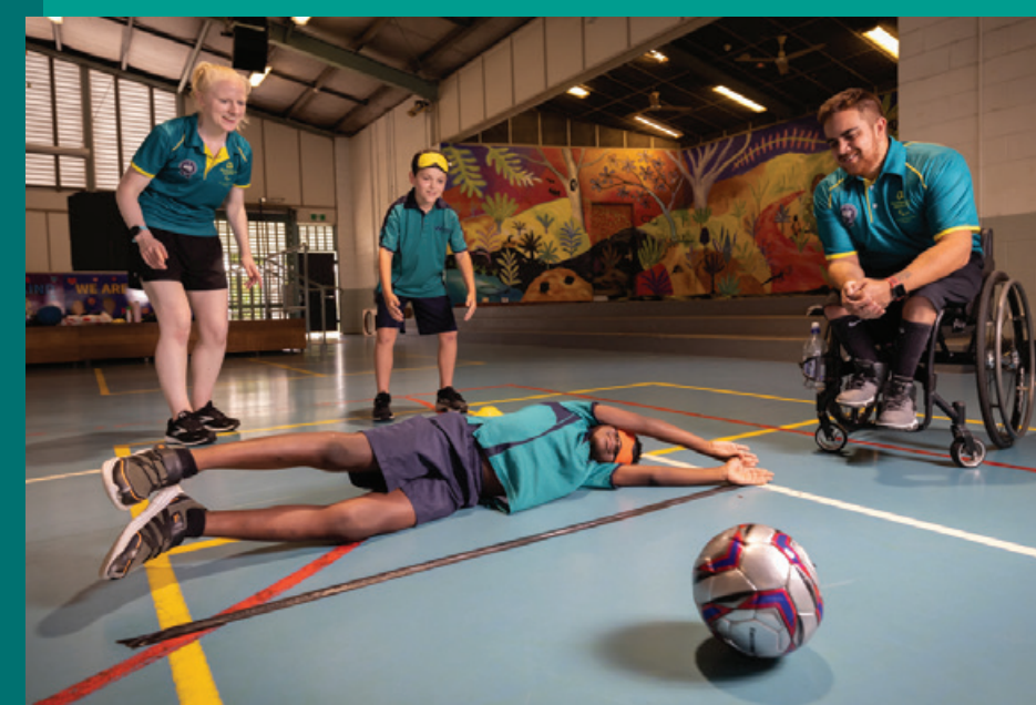
A Paralympic Education Program visit

Paralympics Australia provided funding to 17 National Sporting Organisations to deliver classification activities.